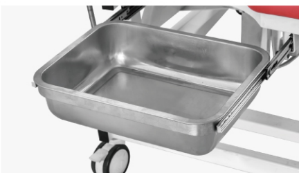
Stainless Steel Basin