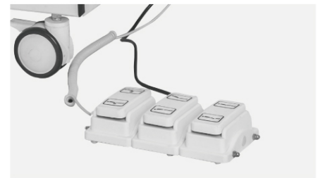
Pedal Remote Controller