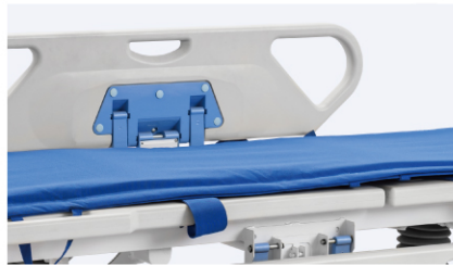
Water proof mattrass with 2 belts