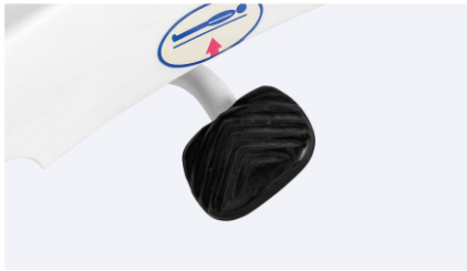
Hydraulic treadle for rise

LEADING BRAND OF CHINA MEDICAL FURNITURE