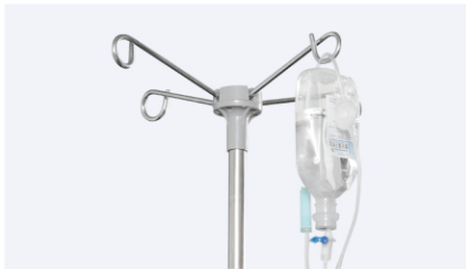
Full SS IV pole, bearing 15kg

TPR tire no worn out after running 30KM, save anti-winding hard shell, united forming without bolts