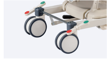
6 inch controlled castors