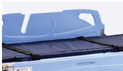
Water proof mattress with 2 belts