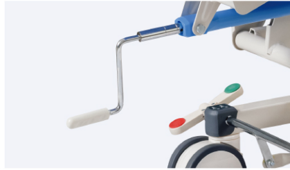
Stainless steel handle with plastic handle, more durable and beautiful