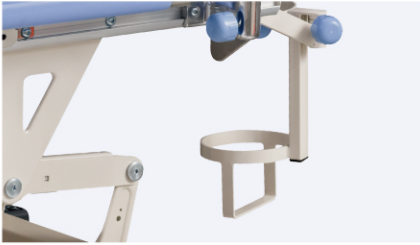
Adjustable vertical oxygen bottle, load capacity:15KG

LEADING BRAND OF CHINA MEDICAL FURNITURE