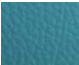
Lake blue 5509-27