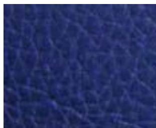
Navy blue 2201-42