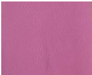
Light rose red 2892-15