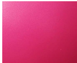
Rose red 2201-30