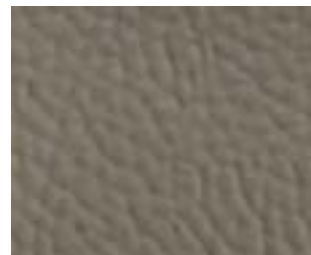
Light grey 5509-14