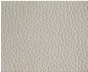
Off white 5509-1