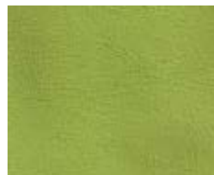
Light green 2210-88