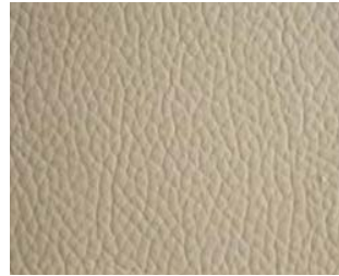
Off white 5509-2