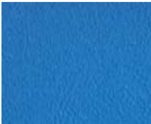
Sky blue 5510-7