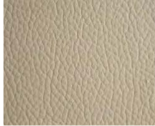
Off white 5509-2