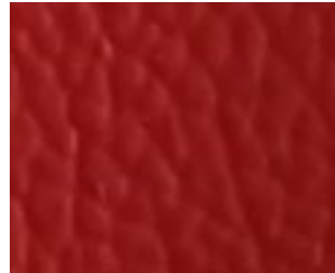
Wine red 2209-22