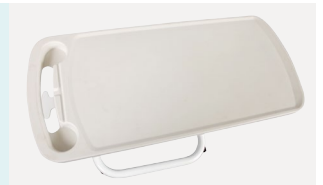
Table top is made of HDPE, easy clean, high quality environmental material, light weight, corrosion resistance, impact resistance, easy to clean and disinfect, durable for use. With groove to put cups and pen.